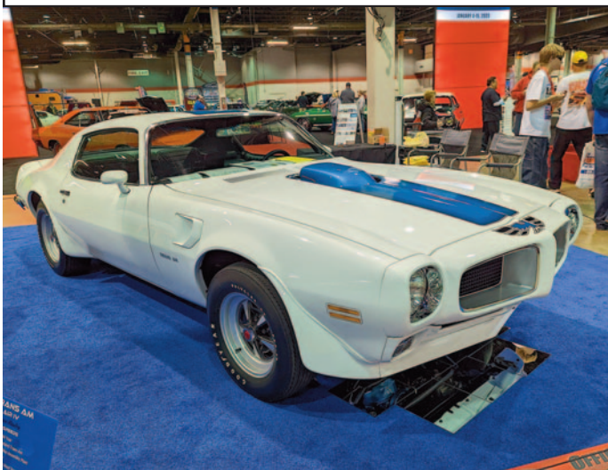
Jurgen Stanley's 1970 1/2 Ram Air IV Trans Am was the subject of a MCACN Unveiling and is one of just 88 cars built.