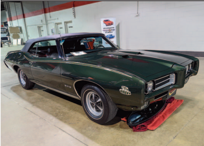
John Wysocki's Midnight Green 1969 Judge convertible is a gorgeous and correct example of the 108 cars built. Check out the Goodyear white stripes!