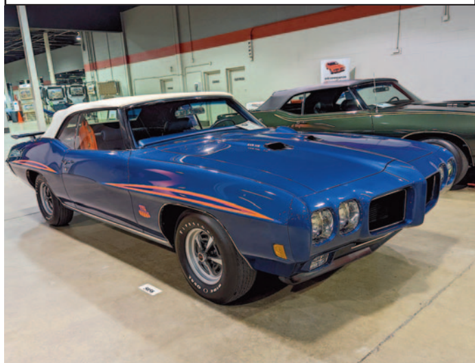
Steven Race brought out his gorgeous Atoll Blue 1970 Judge convertible up from Atlanta to Rosemont. It is one of just 168 built.