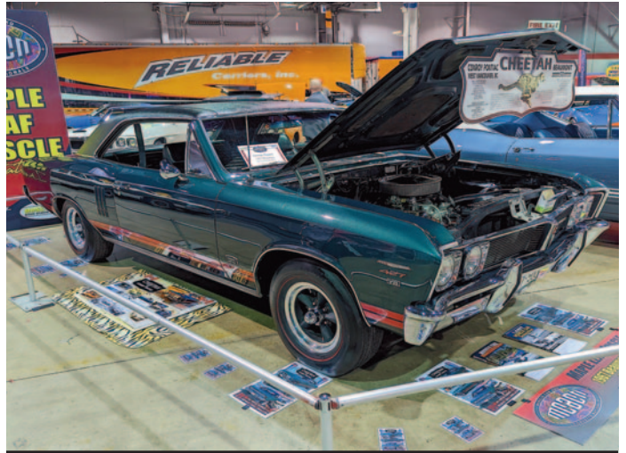
George Pappas' Conroy Pontiac Cheetah 427 is a specialty '67 Beaumont SD much like a Yenko or Royal Bobcat. It boasted 450 horses, a four-speed & 4.10s.