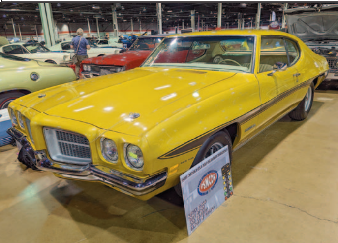
Kevin Ross' 1971 GT-37 features a 455 HO and four-speed and ran in the Pure Stock Muscledrags. It has run a best of 13.404 at 107.70 mph.