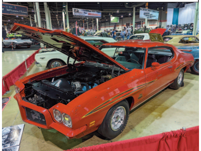
Phil Mitchell's pilot-line 1971 Judge was built before regular production to test tooling and build quality. They were often used for promotion and photography.