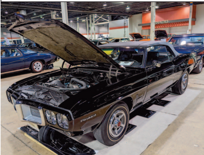
Looking stunning in triple black, Eric Petosa's 1969 Firebird 400 convertible kept it elegant with white-stripe tires and Code 452 Custom Wheel Covers.