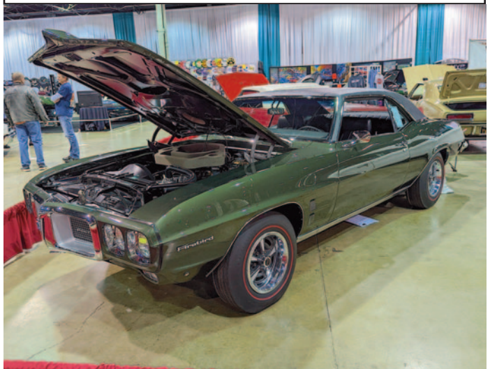
Phil Mitchell's 1969 Ram Air IV Firebird is one of just 157 cars built. It features the popular Verdoro Green and black vinyl top and interior combination.