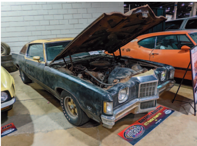
Pontiacs were well-represented in the Barn Finds area, curated by Ryan Brutt. Ron Novitski's 1972 SSJ features the optional American 200S wheels.