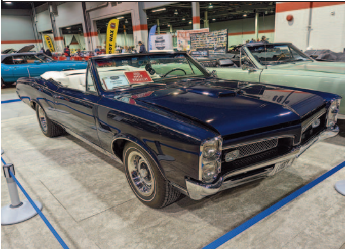
Angelo Dimitri's 1967 GTO convertible featured gorgeous Fathom Blue paint, Rally I wheels and Parchment interior with the optional headrests. Sweet!