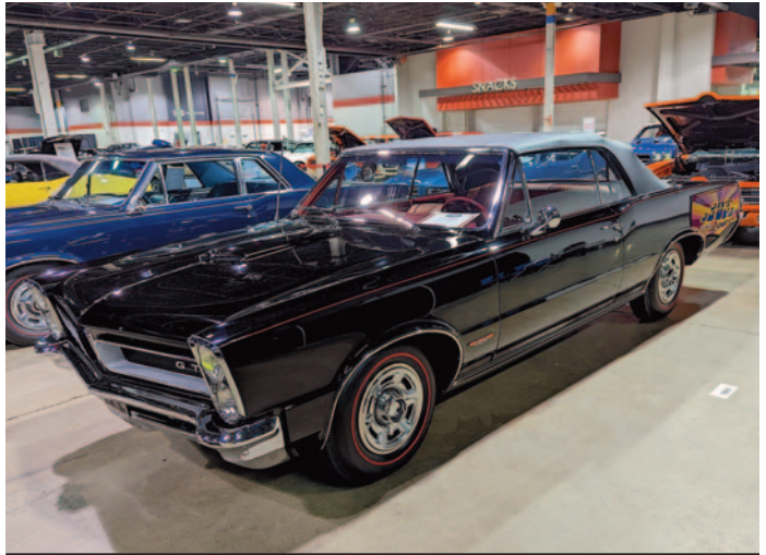
Larry Serres' '65 GTO convertible features a red interior and is a GTOAA Concours Gold winner. It's a very high-quality restoration with a proven record of wins.