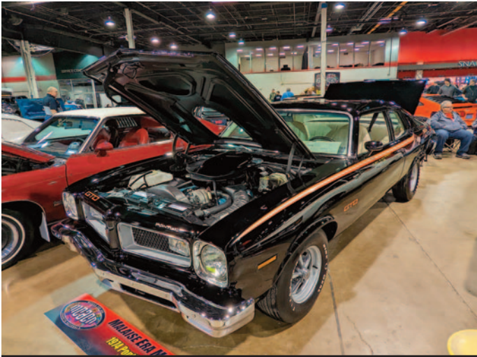
Tim Smith's gorgeous black 1974 GTO is one of just 7,058 cars built. It was part of the "Malaise Era Muscle" display and it fit the spirit perfectly.