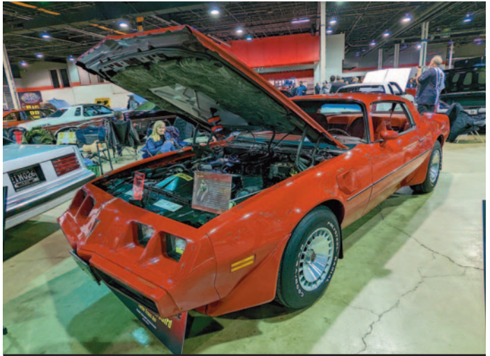
Ken and Theresa Brown's 1980 Trans Am features the top-level 301 Turbo V-8 and finned turbine wheels. The red with red velour interior takes you right back.