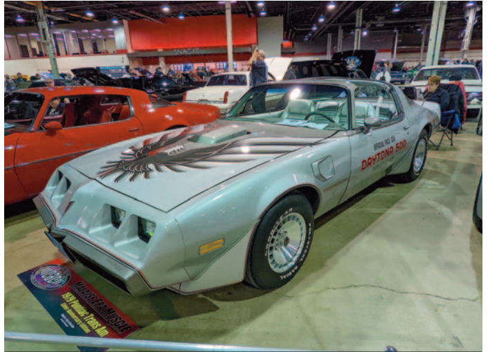
The "Malaise Era Muscle" display saw some great examples of late 1970s machines, like Gary Roeske's 1979 10th Anniversary/Daytona Pace Car Trans Am.