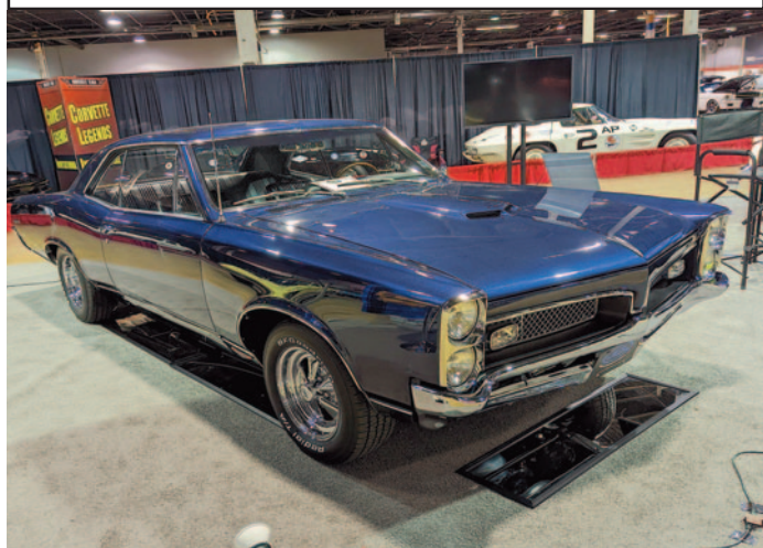
Thomas Sell's 1967 GTO was restored by MCR and features "Day Two" mods like the Cragar SS wheels complementing stock options like the wood wheel.