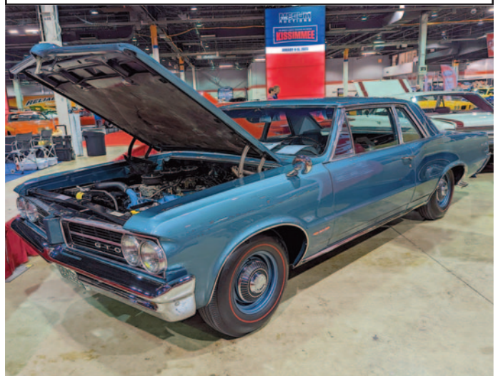
Phil Mitchell's spectacular Gulfstream Aqua 1964 GTO sport coupe features a 389 Tri-Power and color-keyed wheels with "dog dish" caps and redlines.