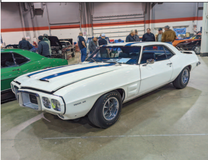
Bruce Eilenberger's 1969 Trans Am is one of the 697 built and struck an imposing impression. Goodyear Polyglas F70-14 tires add an authentic touch.