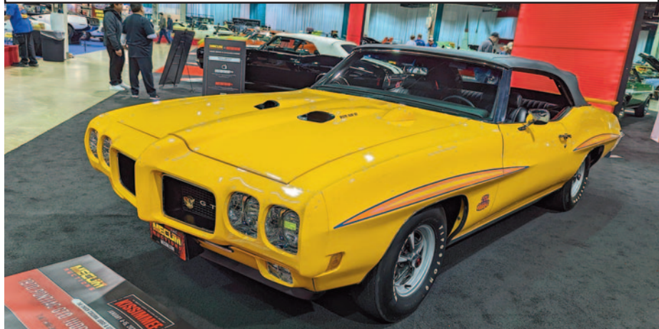
This 1970 Ram Air IV GTO Judge convertible is one of just seven built and was part of the Chuck Cocoma Collection. It later sold at Mecum Kissimmee for a whopping $1.1 Million.