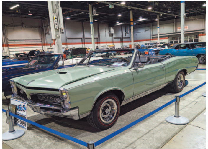
Angelo Dimitri also displayed a Linden Green 1967 GTO convertible, which featured redlines on Rally I wheels and a black interior with headrests.