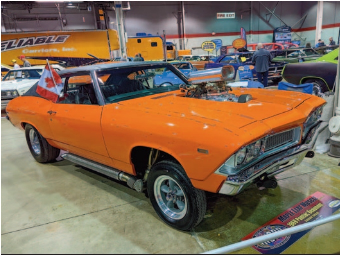
The "Maple Leaf Muscle" display featured a variety of Canadian variants of American models, like Albert Galdi's '69 Beaumont gasser with a blown big block.