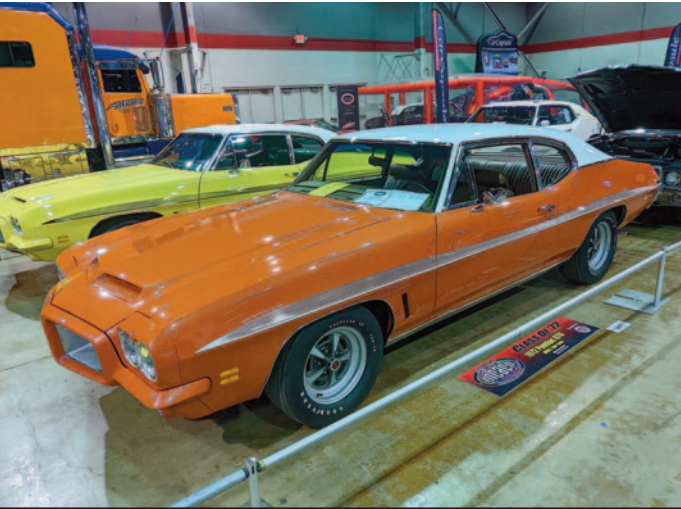
Fred Feist's 1972 GTO sport coupe is a rare two-tone with a bench seat and laser side stripe. Power comes from a 400 with a four-barrel.