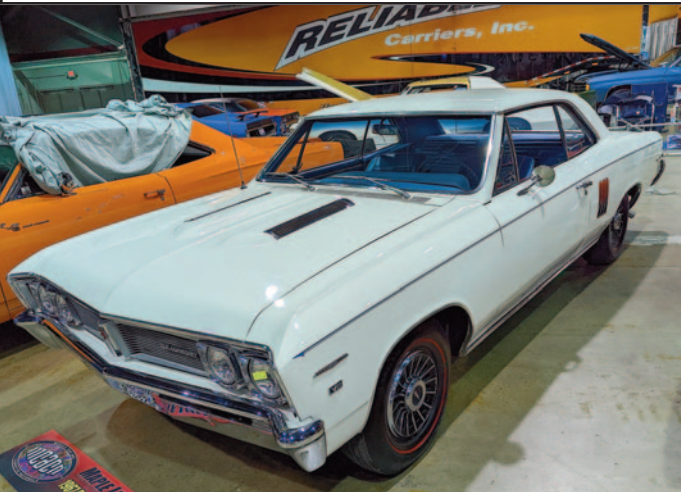
Another rare Canadian in the "Maple Leaf Muscle" collection is this 1967 Beaumont Sport Deluxe 396 owned by The Biase Corporation.