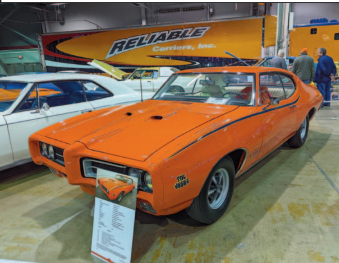
Bruno Beltrame's spectacular 1969 Ram Air IV GTO Judge features a Parchment interior and standard fixed headlamps. This one was ordered to go!