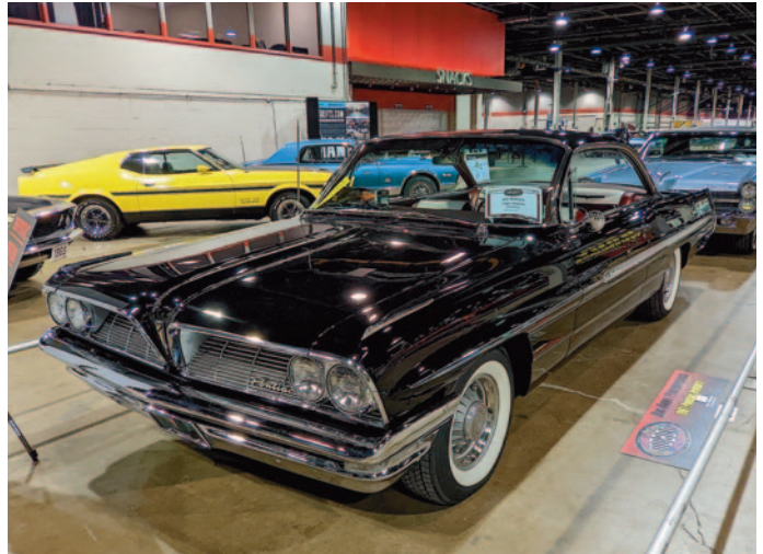
Jim Wallace's 1961 Ventura was part of the "Big Body Performance" collection and looked spectacular with its tri-tone red interior and 8-lug wheels.