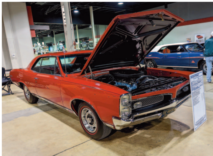
Roger Clouse's 1967 GTO features the top-dog Ram Air 400, four-speed and Safe-T-Track rearend. Rally I wheels with redlines complement the red exterior.