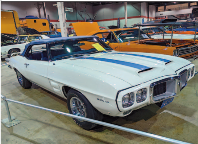
This 1969 T/A convertible is one of eight built and was part of the Maple Leaf Muscle collection as it was delivered to Canada. It's part of the Brothers Collection.