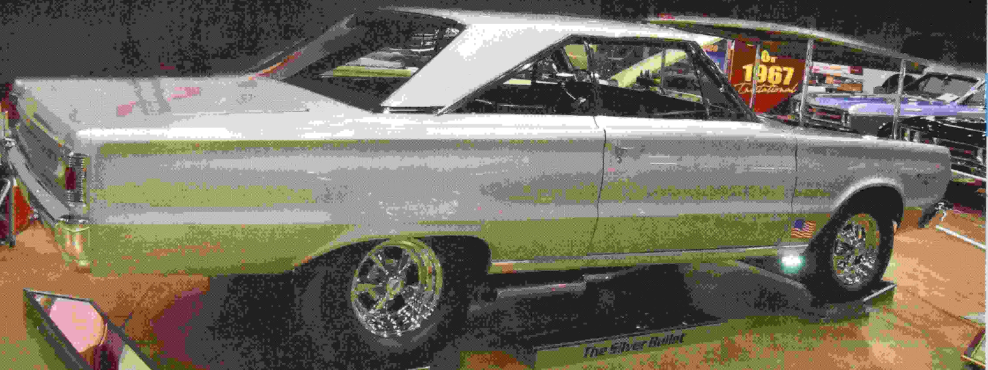
THE FAMED "SILVER BULLET" HEMI BELVEDERE/GTX STREET RACER/TEST BED CAR THAT WAS AN UNHOLY TERROR ON THE STREETS OF DETROIT FOR HALF A DECADE WAS OUT ON DISPLAY FOR THE FIRST TIME IN A WHILE, AND IT STILL LOOKS JUST AS MENACING AS IT DID WHEN IT WAS RUMBLING ON WOODWARD BACK IN THE LATE SIXTIES.

Southern Plains Mopar Show now has the potential of becoming one the most exciting and unique car events anywhere.