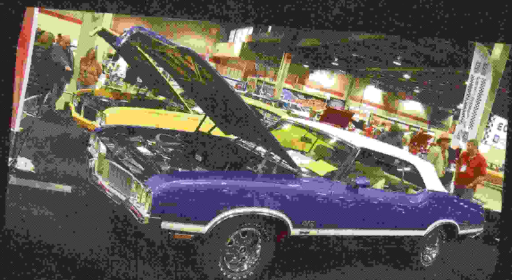
THIS OLDS 442 LEFT THE GM FACTORY LINE PAINTED MOPAR PLUM CRAZY...HOW COOL IS THAT.